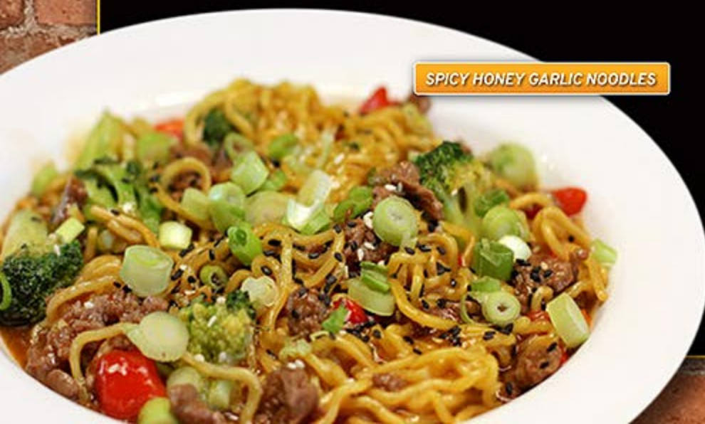
SPICY HONEY GARLIC NOODLES

Gella's signature homemade macaroni and cheese with hand breaded chicken tenders, tossed in buffalo sauce.