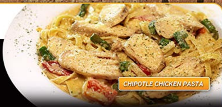
CHIPOTLE CHICKEN PASTA

Tender braised beef short ribs in Gella's classic stroganoff sauce, pappardelle noodles, and mushrooms. Served over mashed potatoes.