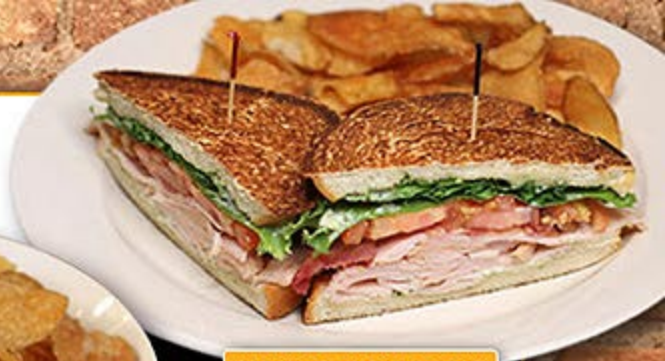
SMOKED TURKEY CLUB