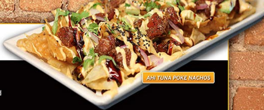
AHI TUNA POKE NACHOS

Seasoned waffle fries, topped with jack cheddar cheese, chopped bacon, Roma tomatoes, green onion, and our Lb. Seasoned Sour Cream.