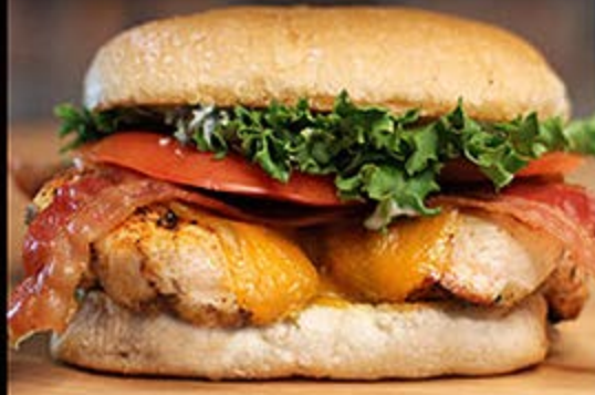
FORT HAYS TIGER CHICKEN SANDWICH