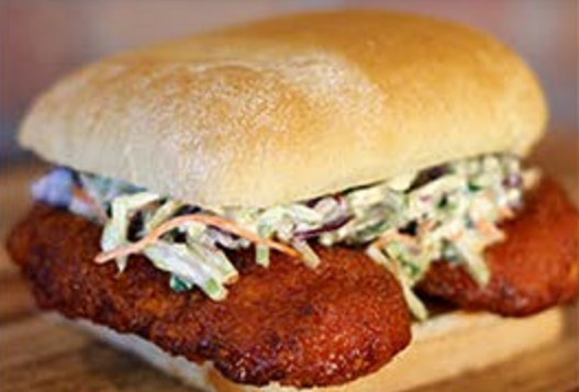
NASHVILLE CHICKEN SANDWICH

A Gella's original. Traditional bierock bread dough, stuffed with seasoned beef, cabbage, and sauerkraut. Baked and smothered in a creamy cheese sauce.